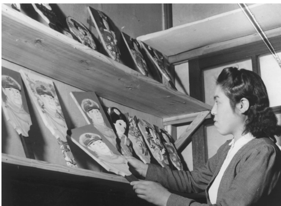
This photo was found at the El Nacional Archive of the INEHRM in Mexico City. An excerpt of a text (perhaps a telegram) that comes with it says: "International News Photo. Doug makes a hit with manufacturers Tokyo, Japan. Gen. Douglas MacArthur is given what the Japanese consider a signal honor. A military portrait of the supreme allied commander now adorns Japan's 'battledores' [...] This is the first time that a foreign personality has had his portrait on the battledores. One of the girl workers of a toy shop places finished samples of the new 'hagoita' on the shelf with some of the older types. (Nov. 13, 1946)".

The craftsmen and women may represent in the hagoita whatever the customer asks for, whatever characters they wish, and there are an endless succession of these among both the leading roles of the plays and the secondary ones, plus the characters of the dance. 15 However, there are certain favourites, the most common being, for example, Sukeroku (a male character), the two