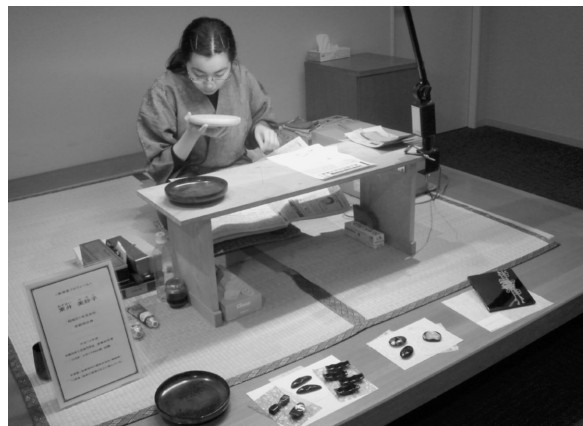
Shunkei lacquer artisan, Gallery of Arts and Crafts in Kyoto, Feb. 2006

It seems necessary—as a prelude to consideration of the particular objects that concern us here—to say a few words about the examples of folk art that can be seen in Japanese museums. In the National Museum of Tokyo, all the lacquers on exhibition carry the name of the maker, and all of these are men. This matter of signatures is an extremely curious phenomenon when dealing with folk art; we find it, above all, when such objects begin to be admitted into museums (which is precisely when they begin to be regarded as “art”). In the National Crafts Gallery of Tokyo, likewise, all the pieces on exhibition carry the name of their maker; and in the Nippon Mingeikan (Japanese Folk Art) museum, in the same city—which is devoted basically to the Mingei Movement—the names of the creators of each piece are given, except in the case of antique works. In the Edo Shitamachi Crafts Museum of Tokyo there are some fifty photographs of recognized craftsmen of the city (and not a single woman). Just for the sake of comparison, in the Museu do Folclore in Rio de Janeiro, the exhibited photographs show a total of 54 craftsmen and 17 craftswomen. Of course, in the real world, the women are always there, although often in a supporting rather than a leading role. To give an