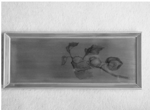
Shunkei lacquer with painted decoration, Takayama, Feb. 2006

After observing and becoming quite well informed about the work process of shunkei making,