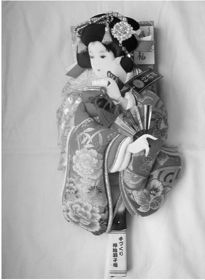
Modern style Hagoita with “a girl with a long-sleeved kimono”, Tokyo, March 2006

tional metropolitan folk art—these are the most expensive—and others that have not. Among the former, there is also a new model that is characterized by the fact that the sleeves of the kimono project over the sides of the battle-dores so as to make them more imposing. The faces are different according to the type, especially as regards the eyes: in the modern type they are slightly rounder, as we have already mentioned. Young people tend to buy the modern kind and older people prefer the classic. The craftswomen too like the classic models best.